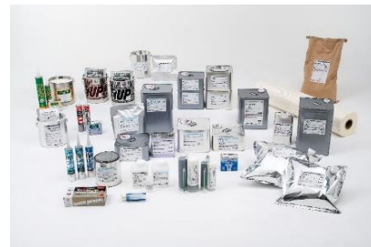
["Bond Business" Civil Engineering Products]

Bycombining the product and construction method development capabilities of the “Bond Business” in the civil engineering and construction fields with the technical capabilities of the “Construction Business”, we believe that we can contribute to extending the life of social capital stock, such as bridges and roads, and that the demand for such maintenance is expected to continue to increase in the future. As such, we are strengthening the “Construction Business” as a pillar of our growth strategy.