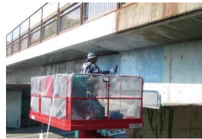
["Construction Business" Project Example]