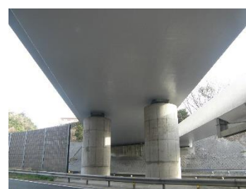
Steel Plate Reinforcement Continuous Fiber Sheet Reinforcement Protection of Concrete Surfaces